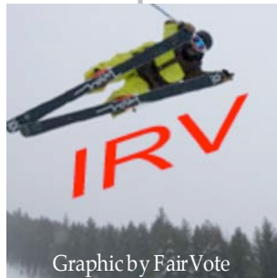
Graphic by FairVote